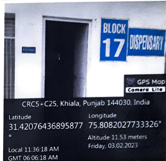
Figure: Health and safety signposts