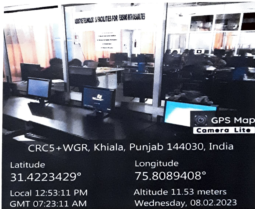
Figure: Assistive technology and facilities